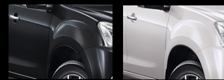
COSMIC BLACK MICA