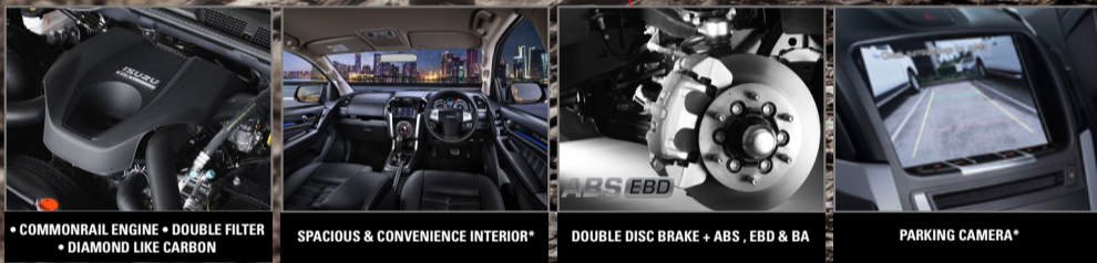
• COMMONRAIL ENGINE • DOUBLE FILTER • DIAMOND LIKE CARBON